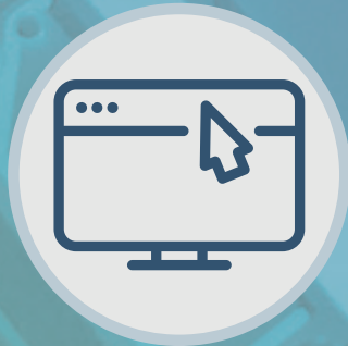
Panel PC / HMI