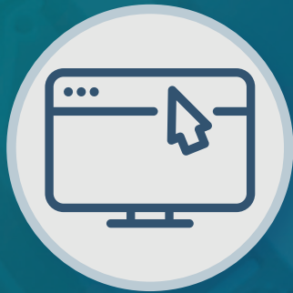
Panel PC / HMI